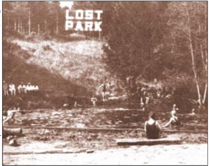
The swimming tank at Lost Park, c. 1927

According to a handbill, the park boasted, "a commodious swimming tank, supplied